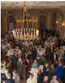
2014 Annual Award Dinner