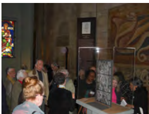
Church Club Members and guests admire stained glass windows from Canterbury Cathedral on loan at The Cloisters

Upper Manhattan Excursion to The Cloisters, The Church of the Intercession & Trinity Church Cemetery and Mausoleum