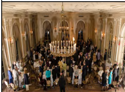
Keeping tradition, guests stand to sing The Church's One Foundation before concluding the evening