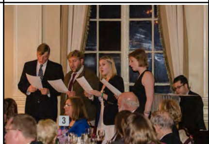
Alumni of Canterbury Downtown Choral Scholars offer a Choral Benediction