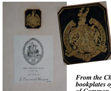
From the Church Club's archives, the bookplates of an 1844 version of The Book of Common Prayer , donated by Club Member Mr. J. Pierpont Morgan in 1905