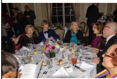
A tableful of merry guests from The Church of the Ascension