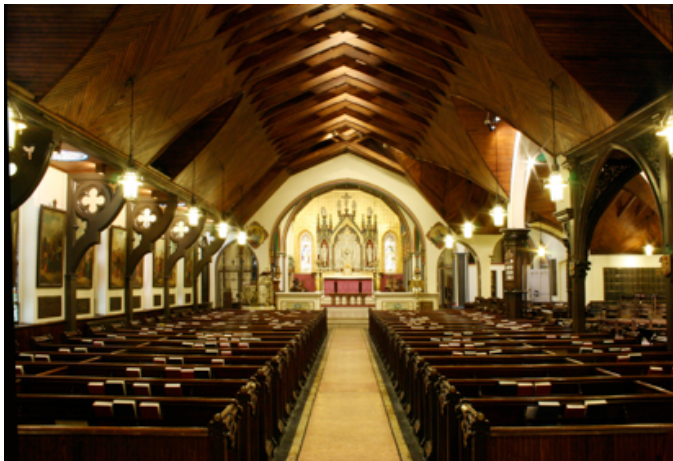
The Church of the Transfiguration, interior center aisle

Cordially invites you to the 2017 Annual Meeting & Barbecue